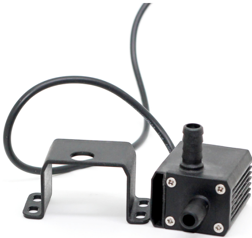
Model #: WMP-130203